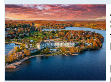
Deerhurst Resort in Huntsville located on Peninsula Lake