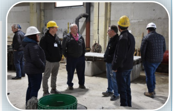
Several Manufacturer Members at the tour of Newmarket Precasts' Orillia location