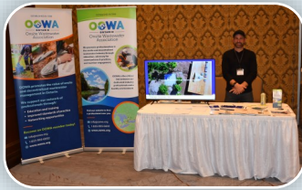
Ontario Onsite Wastewater Association (OOWA) Exhibit